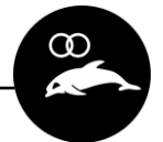
Summer Camp Badge

NOTE: Badges worn in location #5 are Trade/Appointment only. Positioned so that the centre of the badge is midway between the shoulder seam and the elbow when the arm is bent at a 90° angle